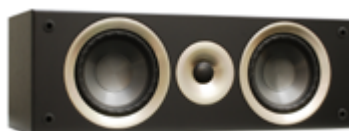
Azure C-40 v.2