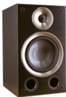
Azure B-40 v.2