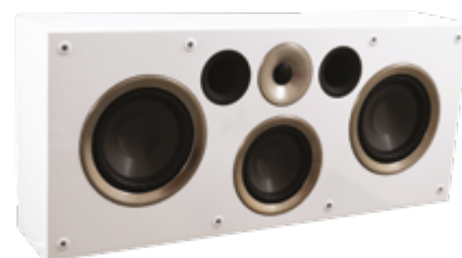
Azure OW-80 LCRS