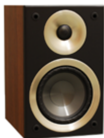
Azure S-40 v.2